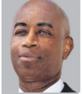
JULY 19, 10:30 AM & 7 PM Chaplain Barry Black United States Senate Washington, DC